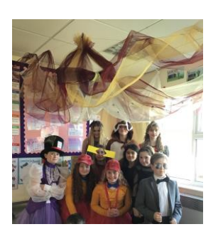
Year 1 Woodland